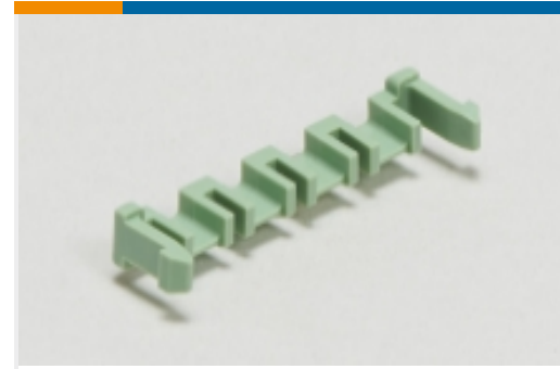
PCB Latches, Locks & Retainers(49)