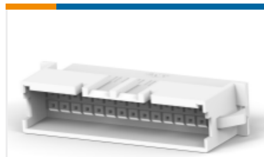
TE Part # 3-2323745-0 HSG,REC,PANEL MOUNT,GWT, DUALROW,EP2.5