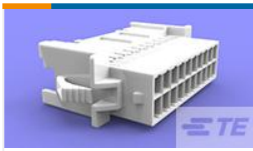
TE Part # 1969595-8 HSG,REC,FREE-HANGING,GWT, DUALROW,EP2.5